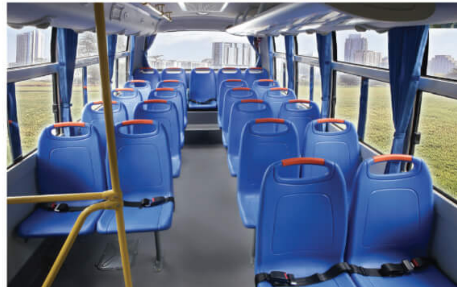
24 Seating Capacity